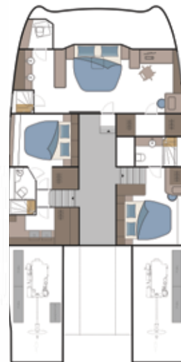
OPTIONAL 3 CABIN w/OWNER'S SUITE DESK