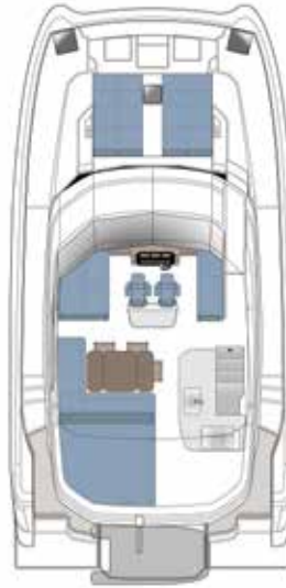
OPTIONAL FLYBRIDGE W/ CAPTAIN'S CHAIRS