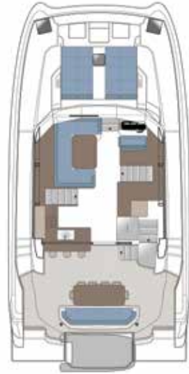
OPTIONAL MAIN DECK W/ INTERIOR HELM