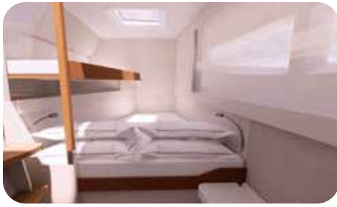
OPTIONAL BUNK BEDS SHOWN.