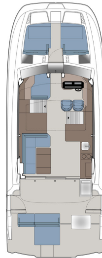
MAIN DECK (Inboard Engines)