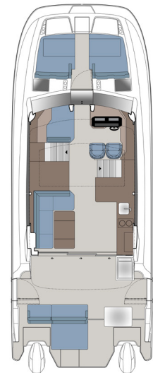
MAIN DECK (Outboard Engines)