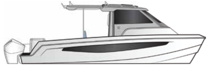
OPTIONAL MAIN DECK W/TOP