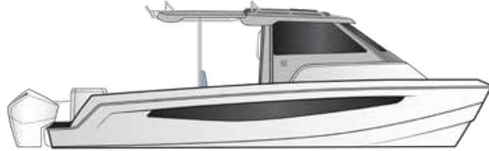
EXTENDED SUN CANOPY

*More options available than shown. For a full listing please review with sales consultant.