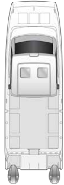
STANDARD MAIN DECK W/ TOP