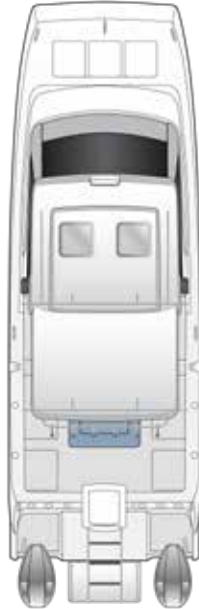
OPTION MAIN DECK W/ TOP AND CANOPY