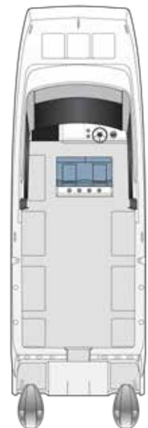
STANDARD MAIN DECK