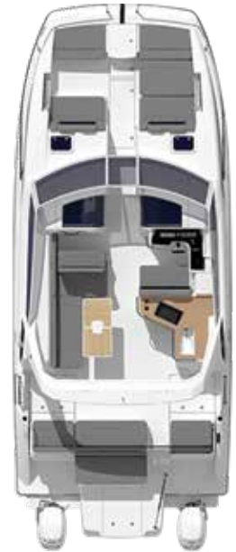
STANDARD MAIN DECK

Resin infused hull, deck, and bulkhead construction creating high strength and stiffness Solid FRP lamination at hull centerlines including all through hulls Vinyl ester resin with excellent corrosive and water resistant properties NPG gelcoat with superior UV resistance All main FRP components resin infused construction including bulkheads Windows in hull and deck high quality acrylic meeting ISO standards