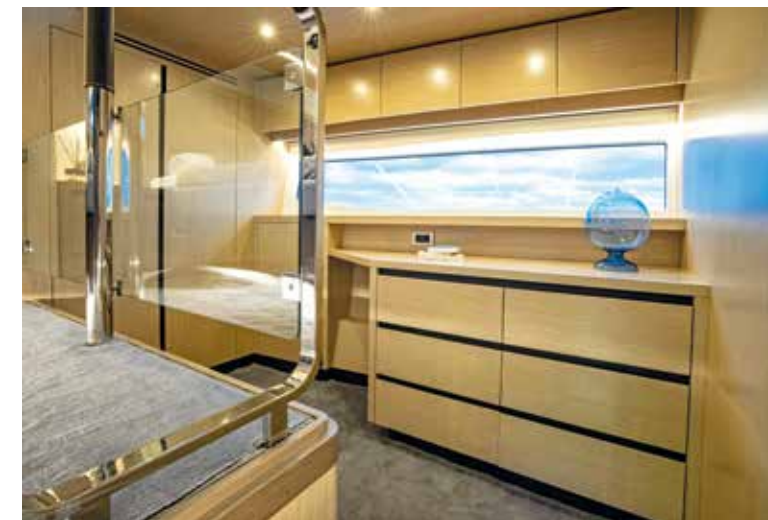
Storage on the starboard side of the full-beam master suite

Forward is another showpiece room – the full-beam master suite. The large windows and king-sized bed, along with a lounge, are the first signs