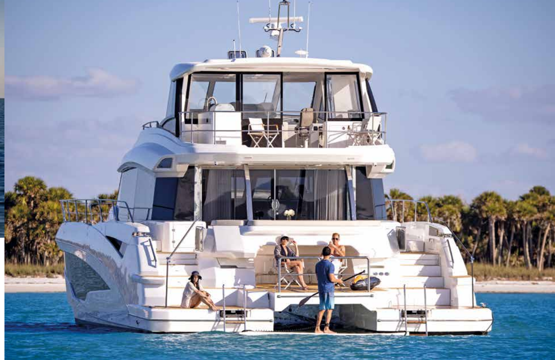
The aft platforms (above) provide a beautiful setting by the water's edge; the large foredeck (below) can be accessed from the side decks or the flybridge, and offers two sofas and large sunbathing areas

Aquila made sure the 70 can be navigated from multiple positions, so