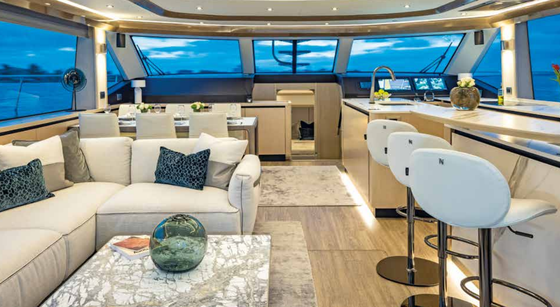
Natuzzi furniture and Gaggenau kitchenware feature in the main-deck interior, which has a lounge and dining table on port side, and a bar and large galley to starboard

besides the full helm in the flybridge, there are wing stations with joystick controls on both sides of the Portuguese bridge as well as in the saloon.