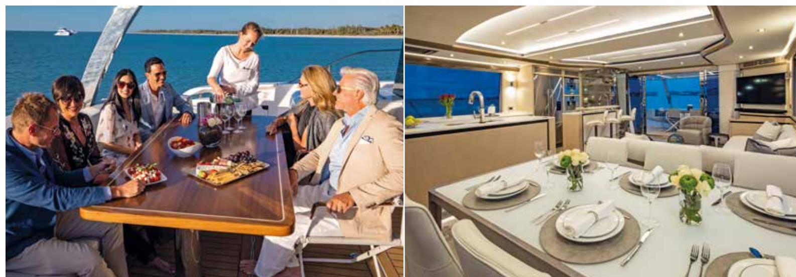
The cockpit (left) offers a covered outdoor area for al fresco dining; the indoor dining table (right) is opposite the galley, which can be visually separated by a raised panel