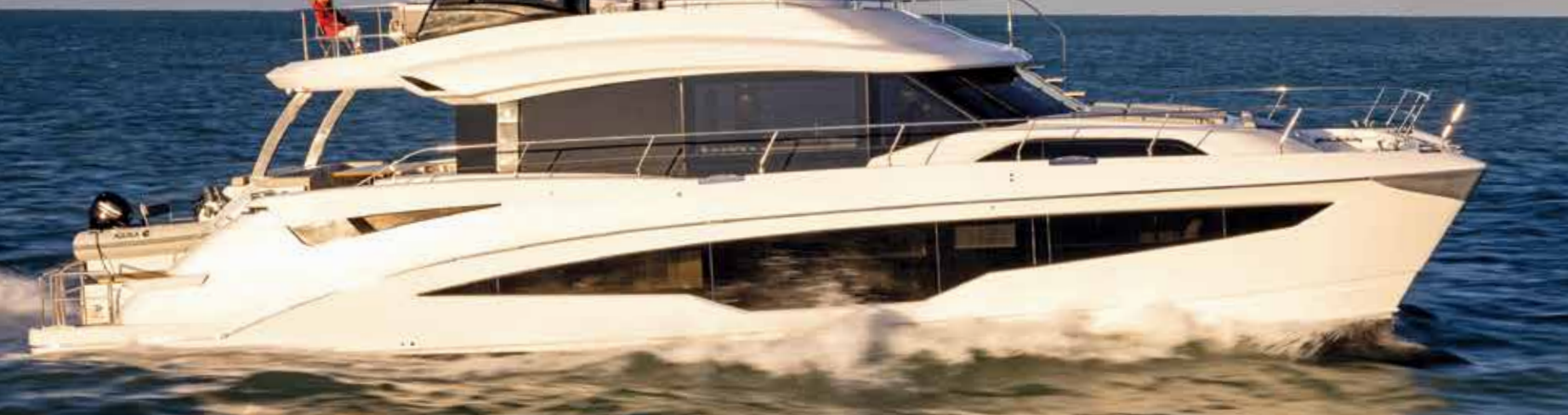
Following feedback from clients, Aquila designed its new flagship powercat to have a similar profile and performance to motor yachts

When charged with creating the Aquila 70, J&J Design was faced with an unusual challenge: design a new 70ft powercat that looked fresh, unlike anything on the water. It had to lose the usual boxy look of most big cats and instead have a sleek, contemporary profile that would match the yacht's top speed of 27 knots.