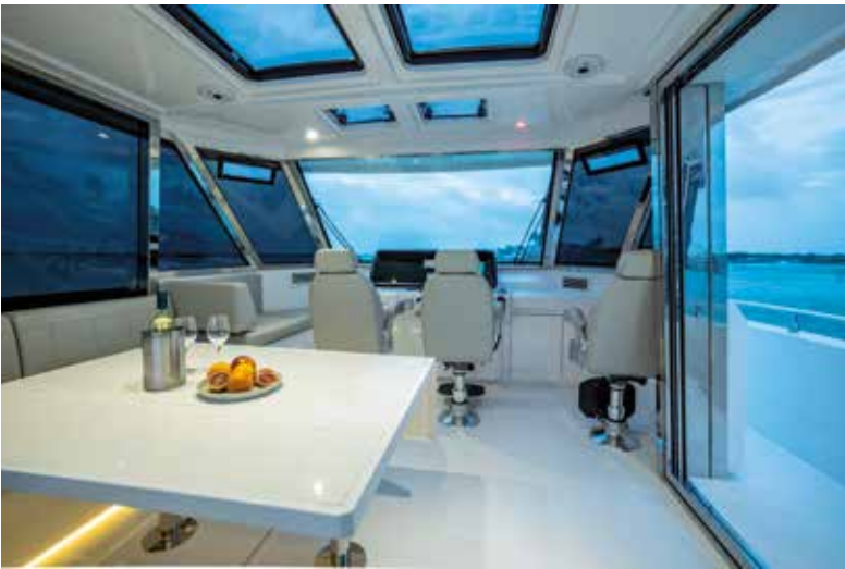
The enclosed ‘skylounge’ version of the flybridge includes an interior with an L-shaped sofa, table and a twin-seat helm flanked by a sofa and chair

www.aquilaboats.com www.simpsonmarine.com