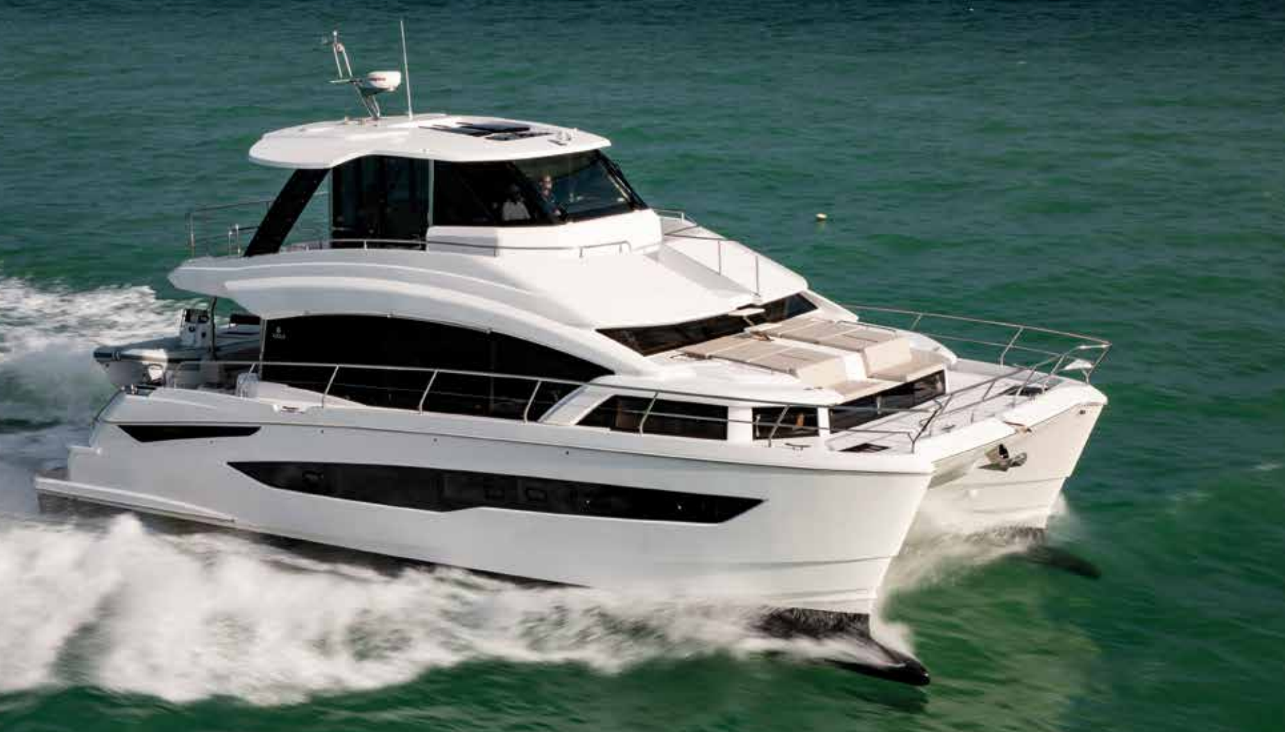
The Aquila 54 Yacht shares similar lines to the flagship 70; the aft platform can carry a 14ft tender, which is deployed by a crane that slides out of the cockpit roof