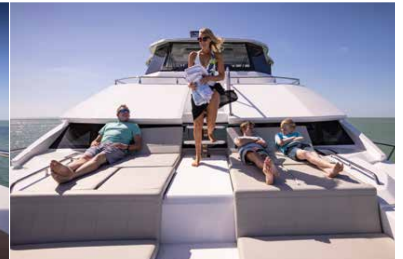
The outdoor galley (left) is a key feature on the open aft deck of the flybridge; the foredeck (right) can be accessed by the side decks or central stairs from the flybridge