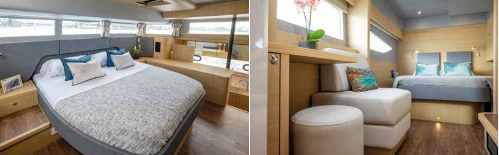
The full-beam master suite (left) is forward of the saloon and benefits from windows on three sides; the starboard guest cabin (right) in the three-cabin layout