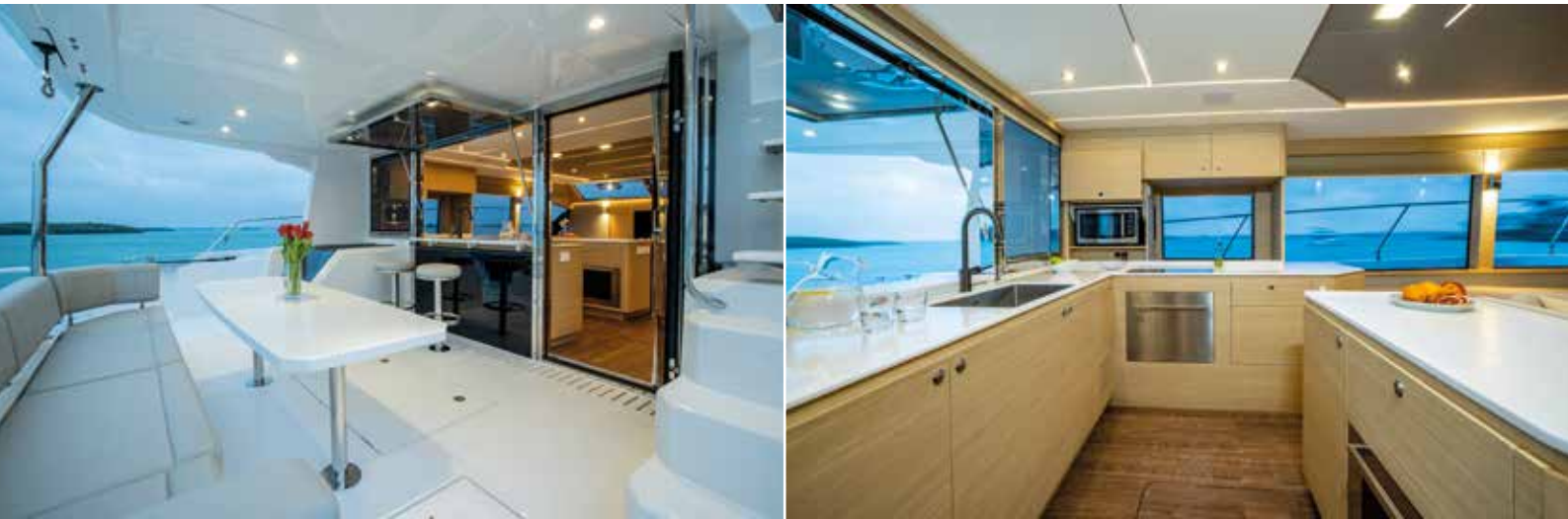
The cockpit (left) has a long bench seat and table that faces the bar and large galley (right), which opens up to the outside through a flip-up window

Built partly in infusion, the 54 offers very good stiffness, a characteristic reinforced by the thickness of the nacelle. The two hulls benefit from real research work. Unlike some powercats that are simply adaptations of sailing models, the Aquila 54 was designed from the start as a motorboat. Like the 70, the hulls feature bow bulbs, a design inherited from