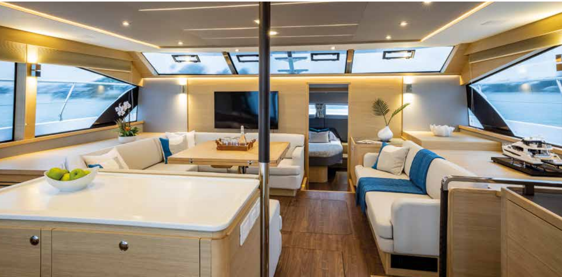
Overlooked by the galley, the saloon has a three-sided sofa to starboard around an adjustable table, a forward-mounted TV and a long sofa to starboard

Back downstairs is one of Aquila’s signature features, the cockpit bar, with two bar stools facing a fold-out countertop and the aft galley courtesy of a lifting window. Inside, the large, U-shaped galley benefits from great light and is packed with storage spaces, while the saloon has a C-shaped sofa and folding table to port plus a sofa to starboard. The version we trialled was the three-cabin layout with the full-beam owner’s suite, which has a king-size bed (2.04m x 1.95m), bathroom with two sinks, separate toilet, separate shower, vanity/office area and a real walk-in closet. Again, there’s plenty of storage space and lots of natural light, and although the extra-large shower is a huge plus, having it as the access to the washing machine was unusual. Each guest cabin occupies a good chunk of each hull and has a queen-size bed (1.98m x 1.63m), bathroom, small desk and, once again, lots of storage space.