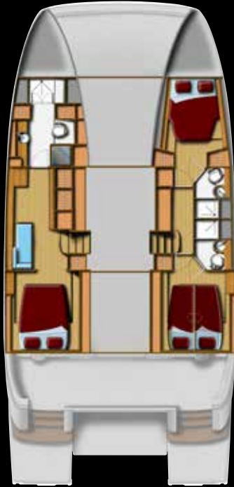
3 Cabin Layout