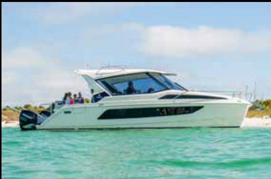
Optional full-height windshield