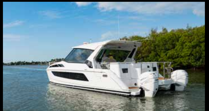
AQUILA 36 POWER CATAMARAN