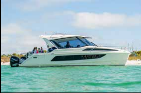
Optional full-height windshield