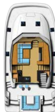
STANDARD MAIN DECK

All specifications and options are subject to change by Sino Eagle Yachts at their sole discretion. Performance is purely indicative and not a contractual commitment. Performance is subject to many variances outside the control of Sino Eagle Yachts. Specifications and graphics in this brochure are non binding and customer must enter into contractual agreement with the Dealer or Agent of Record.