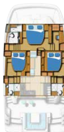
STANDARD 3 CABIN